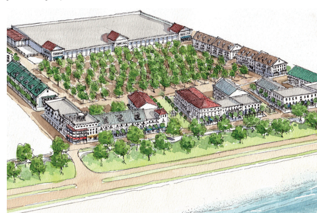
Wal-Mart (before & after)