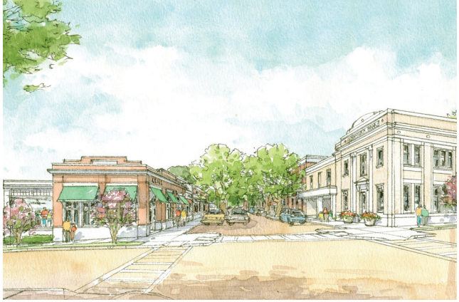
Scenic Drive (before & after)