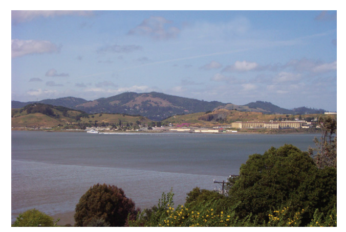
View of San Quentin across the Bay