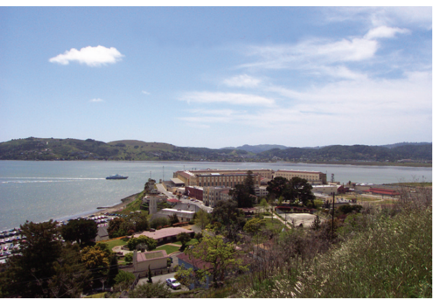
View above the prison across the Bay