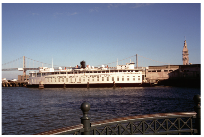
San Francisco ferry that could travel to a San Quentin ferry terminal