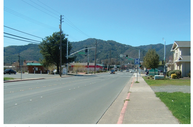
Perkins Street (current)