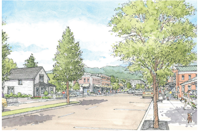
After sketch of Perkins Street