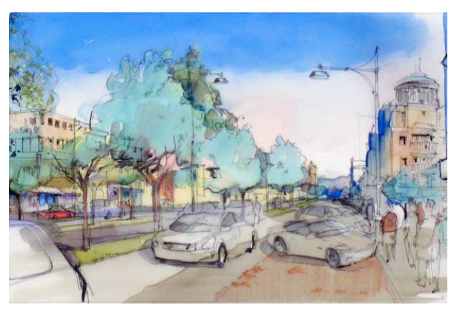
Sketch for Magic Mile area by Robert Orr & Associates