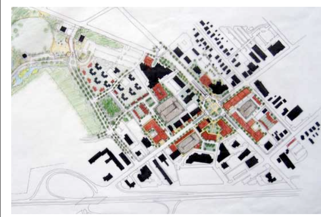
Town Center Plan by Robert Orr & Associates