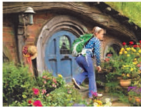
Hobbit Round Gate

Rancho Mark West is a rustic property in Santa Rosa, CA that hosts LandPaths 'Owl Camp' each year. This camp teaches grade school children (with a focus on underserved kids) about the environment-while allowing them to enjoy being in a nature-swimming, gardening and canoeing etc. This masterplan was created using a group process that included volunteers. This was done to allow the unique qualities of the 'Red Barn' and the 'Old Ranch' atmosphere to be enhanced while adding a rainwater catchment tank and othe amenities to the site. Art was used to explain scientific concepts such as a histogram of historic rainfall totals on the site.