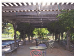
Arbor for Shade with Grapevines