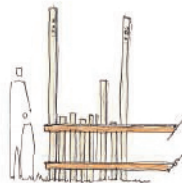
Fence Rainfall Histogram