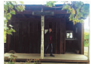
W/C and Welcome House