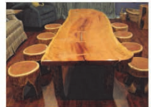
Custom Oak Tables/3 legged stools